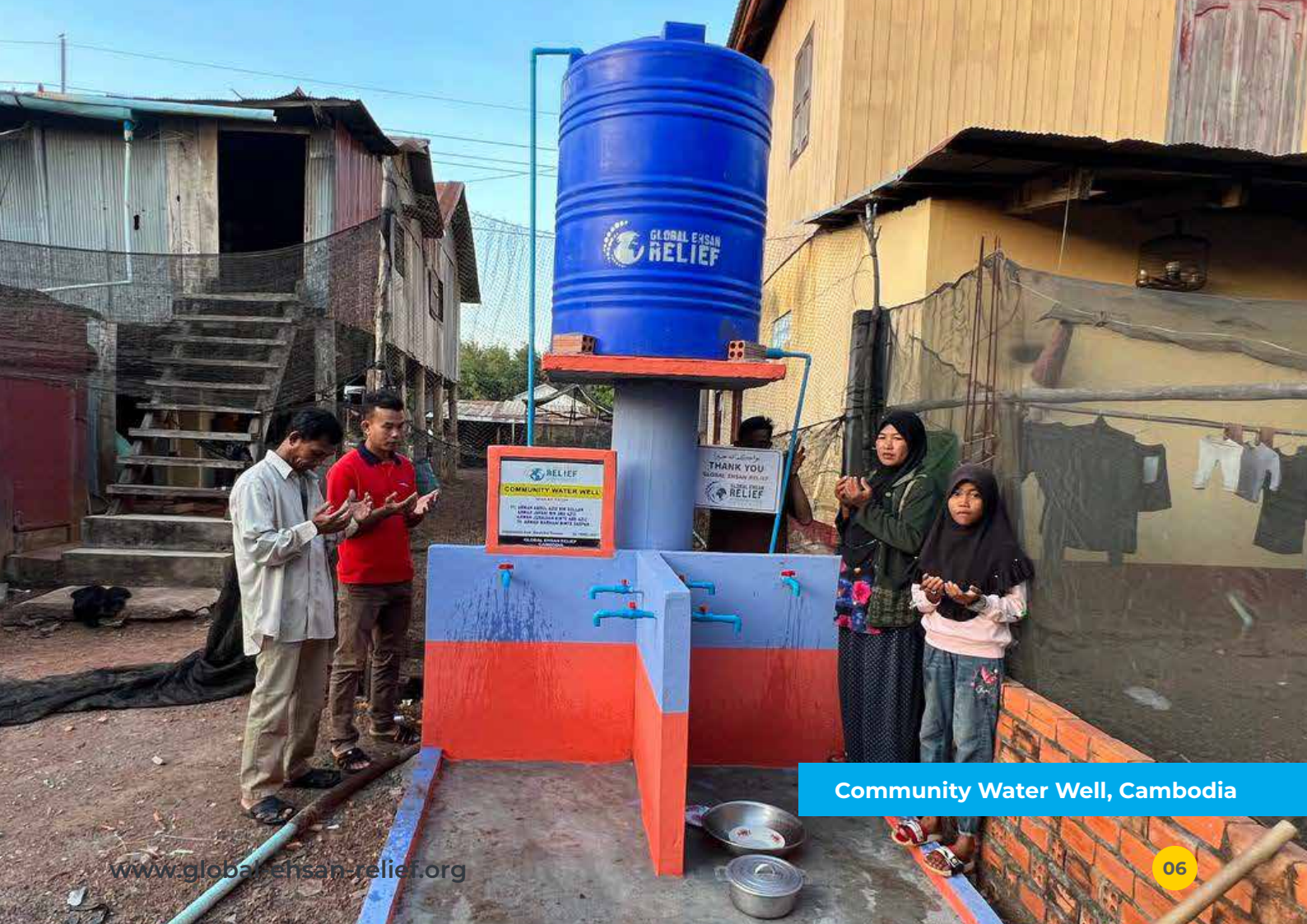
Community Water Well, Cambodia