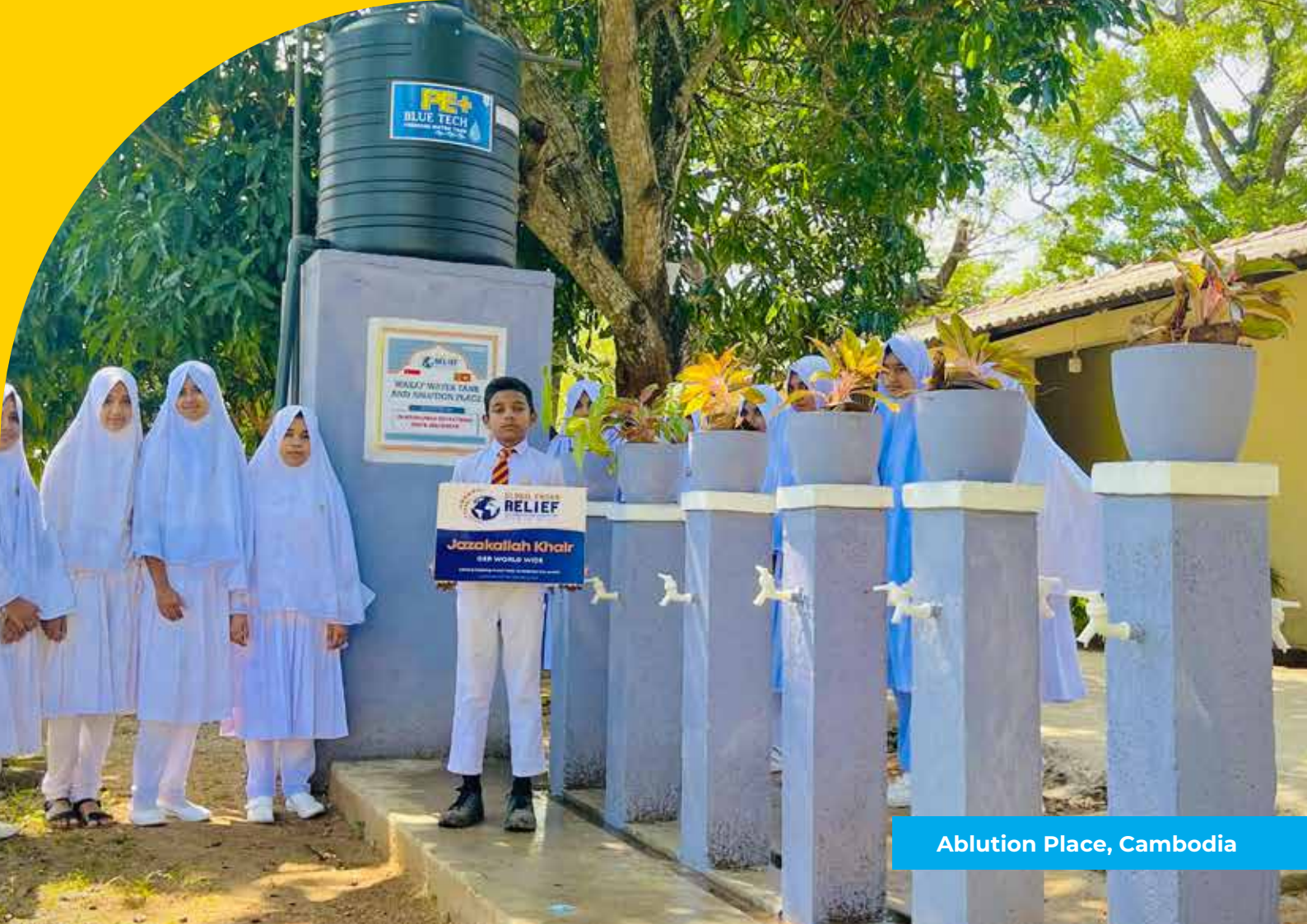
Ablution Place, Cambodia