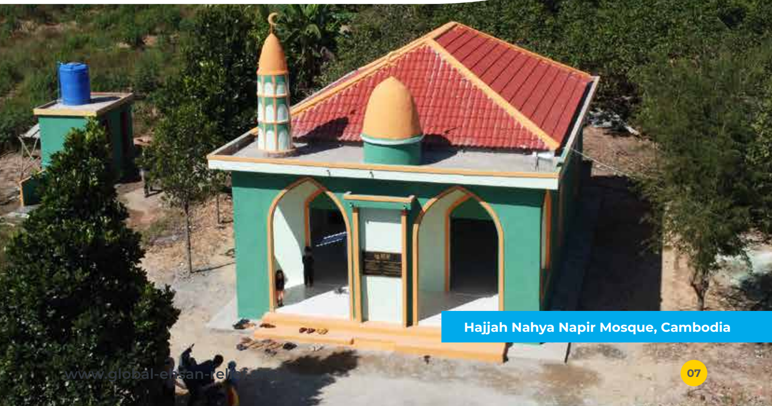
Hajjah Nahya Napir Mosque, Cambodia