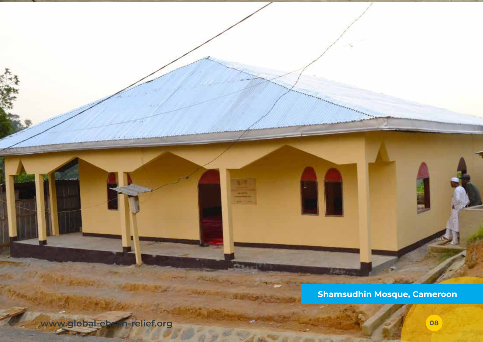
Shamsudhin Mosque, Cameroon