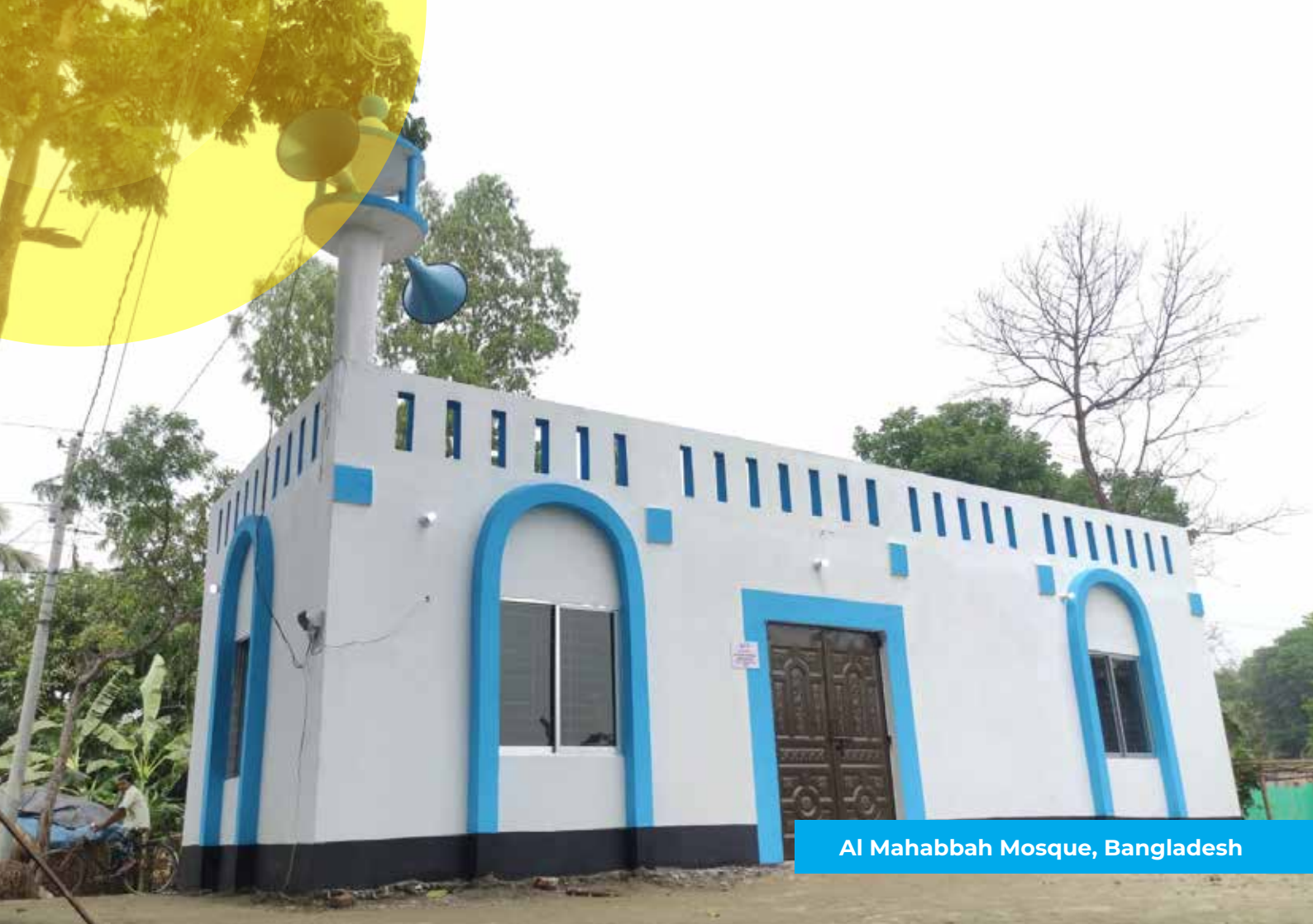
Al Mahabbah Mosque, Bangladesh