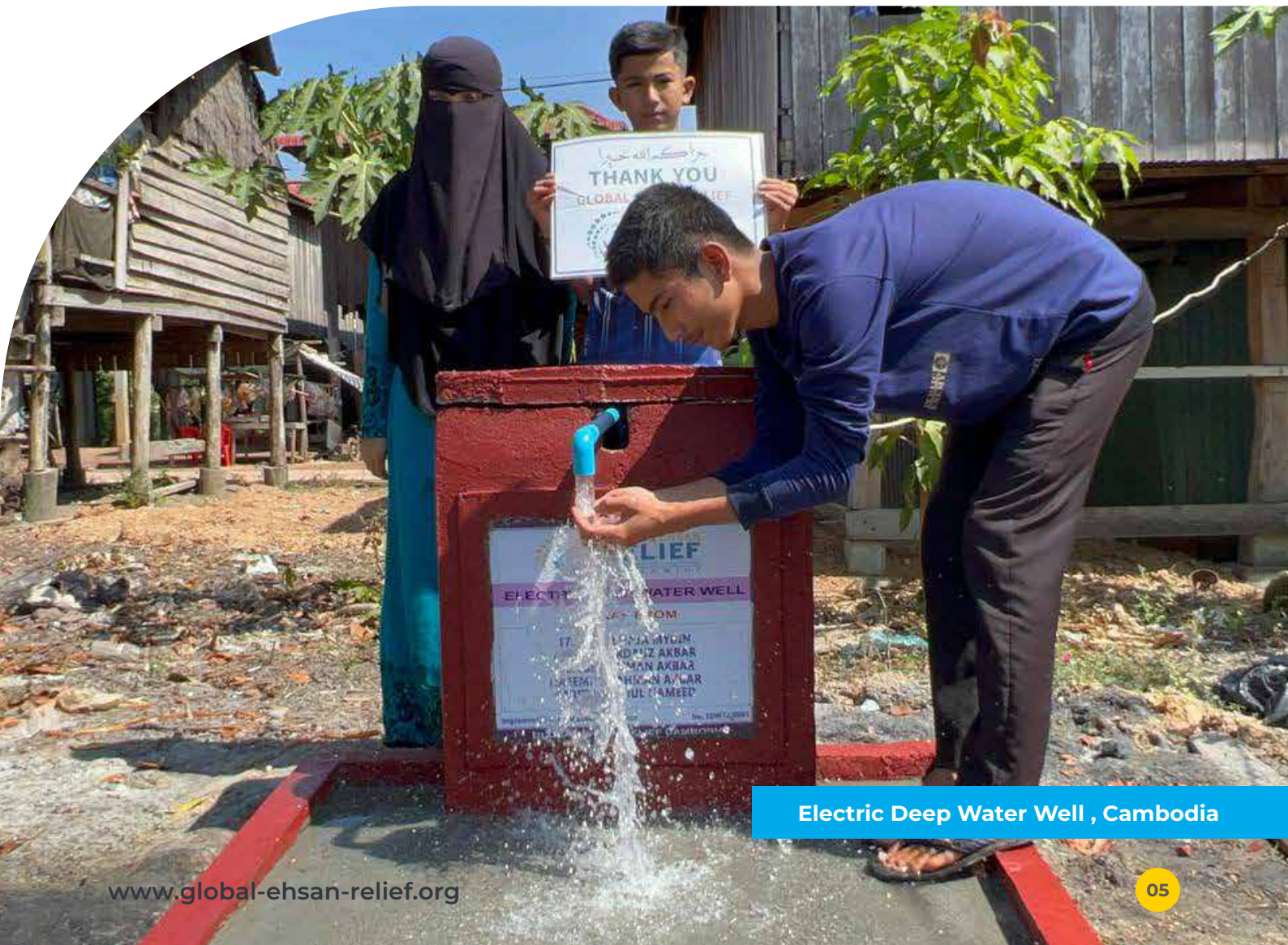
Electric Deep Water Well , Cambodia