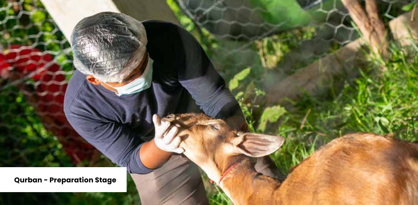
Qurban - Preparation Stage