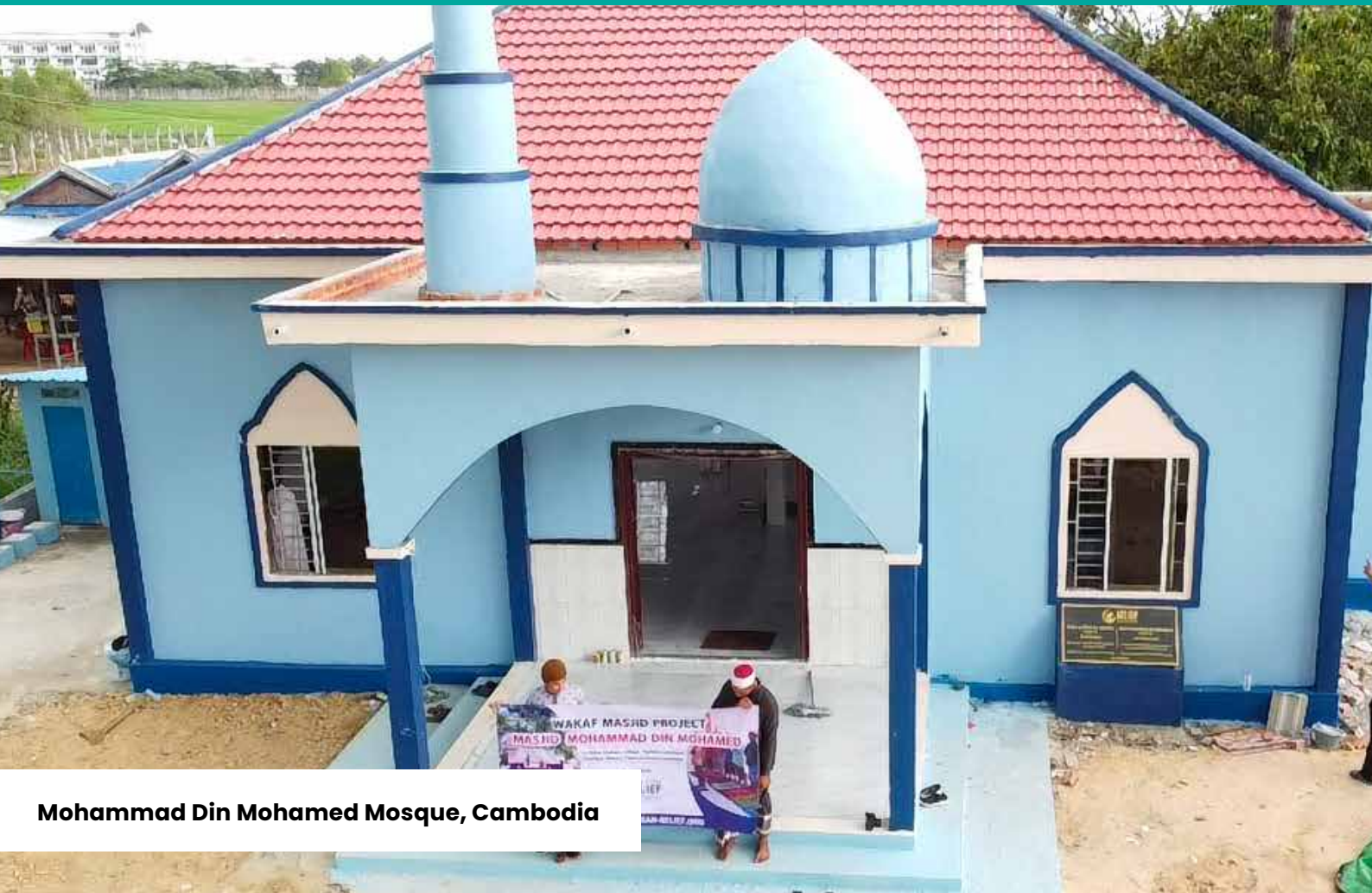
Mohammad Din Mohamed Mosque, Cambodia