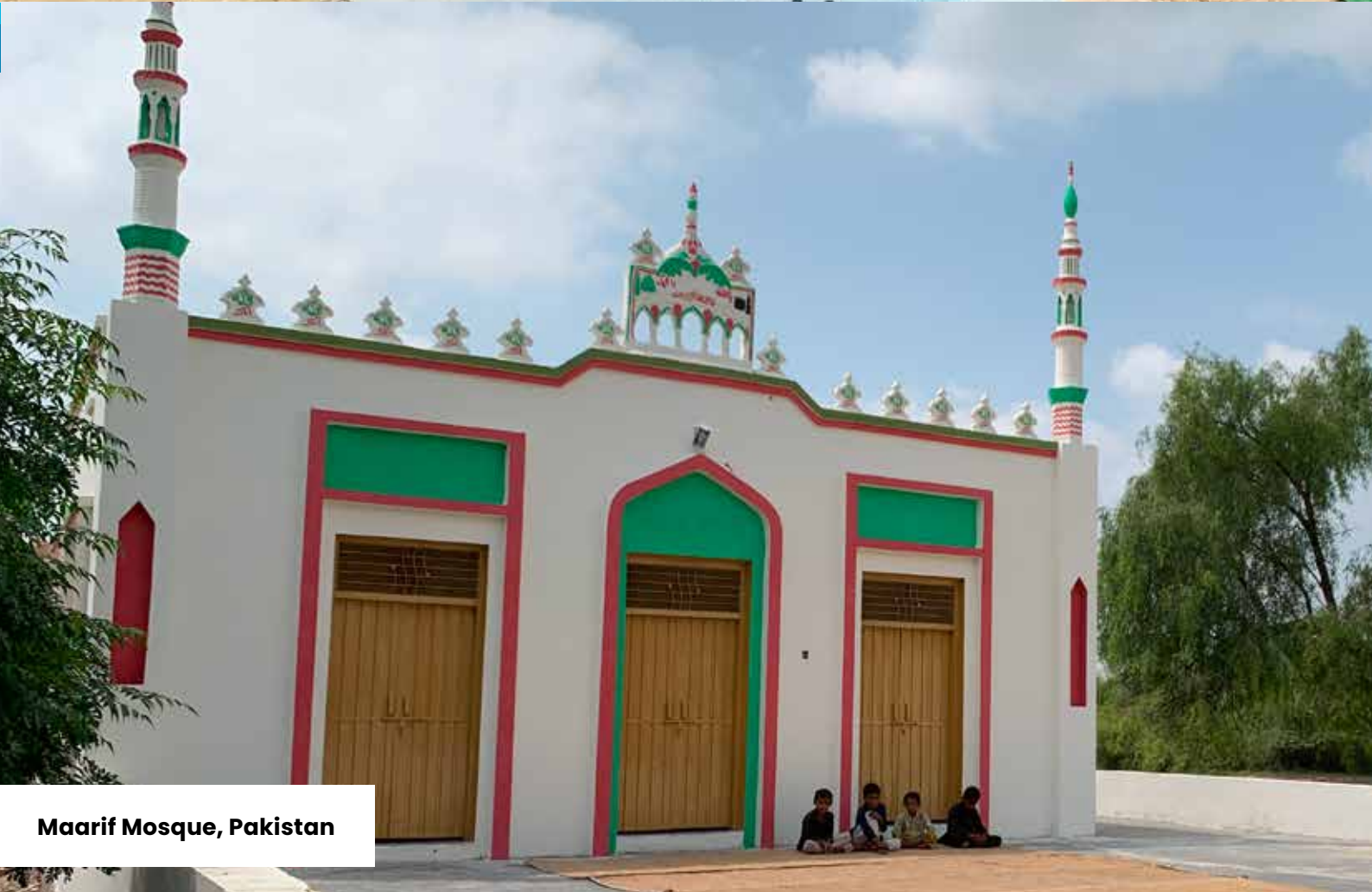
Maarif Mosque, Pakistan