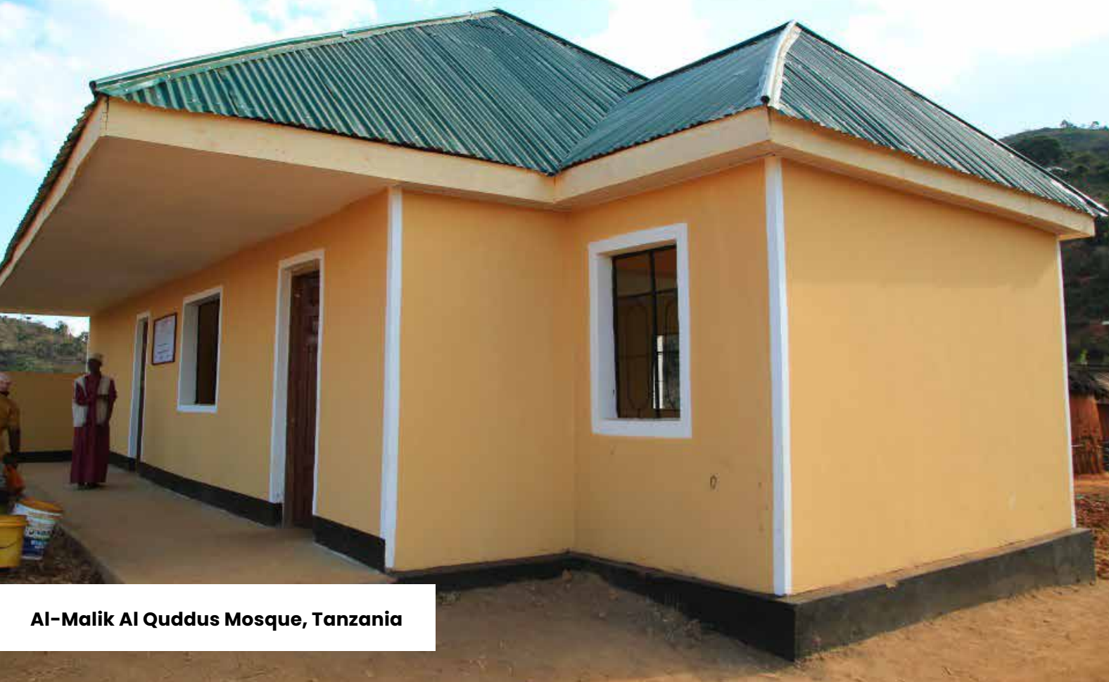
Al-Malik Al Quddus Mosque, Tanzania