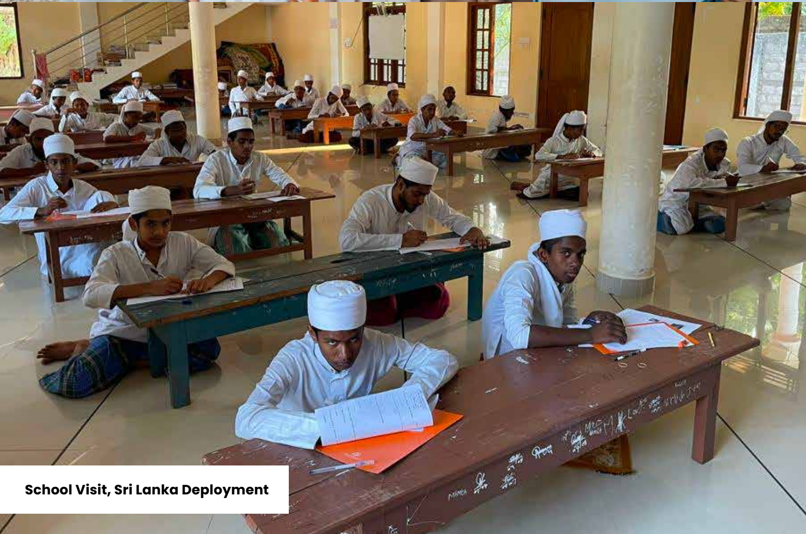
School Visit, Sri Lanka Deployment