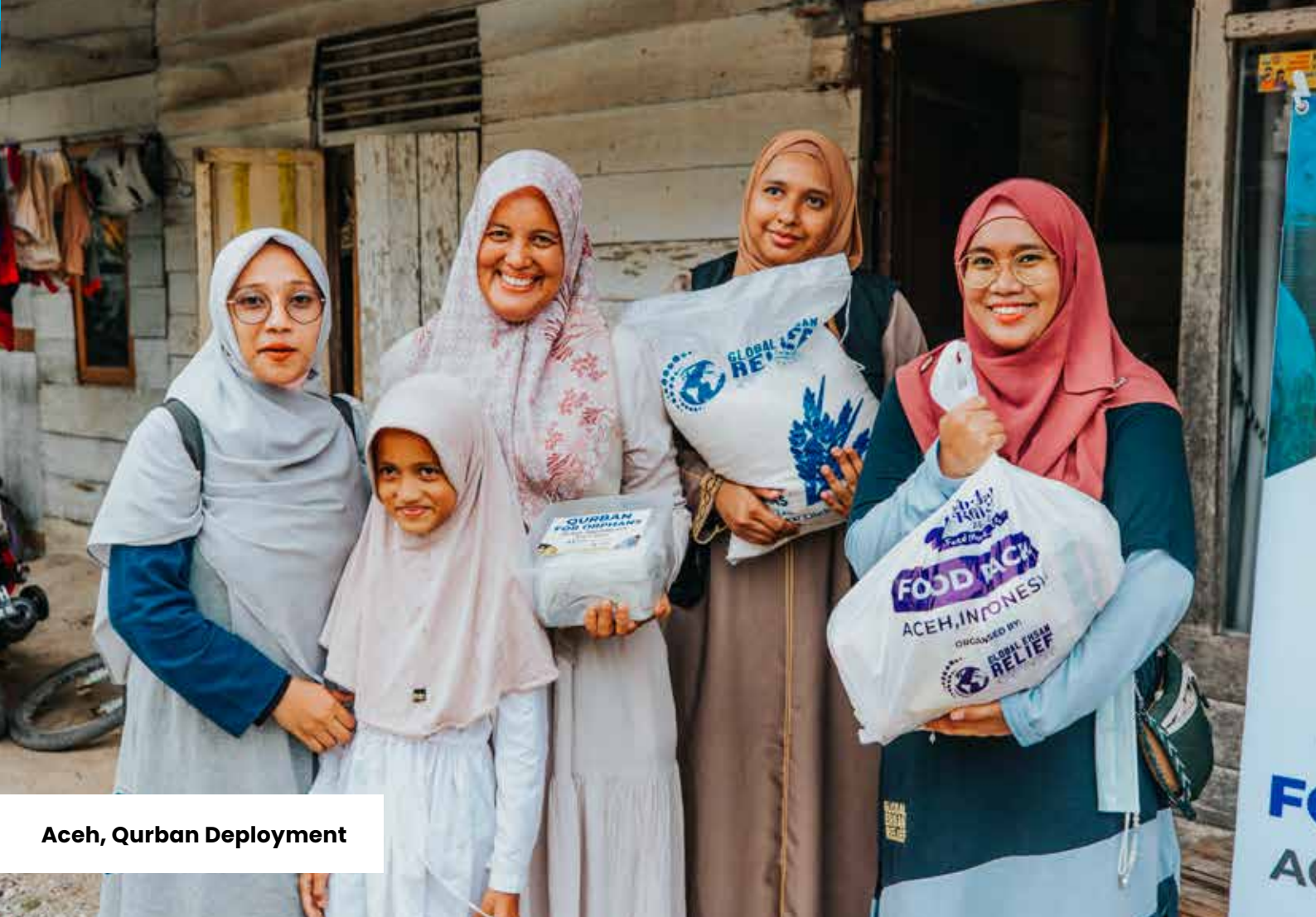
Aceh, Qurban Deployment